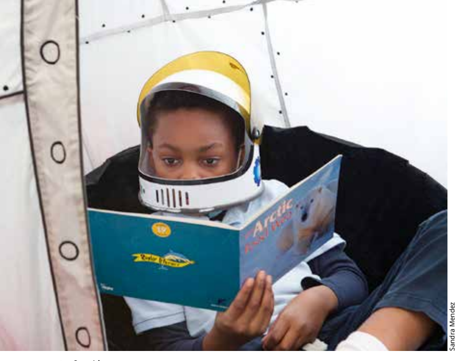
▲ Outfitted in astronaut gear, a Downers Grove student seems captivated while reading a book inside a make-believe capsule.