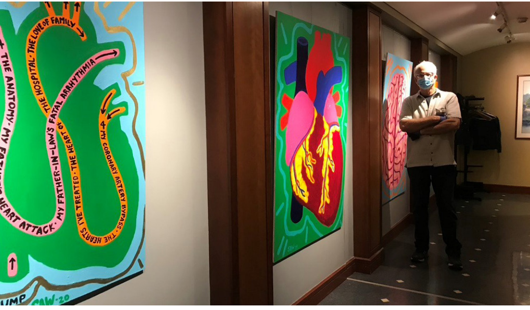
▲ The physician lounge art exhibits