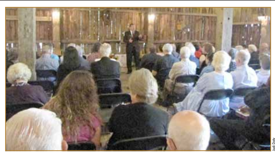
Members of the Buchanan Church and community friends gathered Aug. 23-24 in an old barn located west of town to recall God's leading and teaching in the Church's past history.

The first Sabbath morning message was titled "Organizing for Mission," and focused on the Three Angels' Messages in light of two historical anniversaries this year — the 150th anniversary of the organization of the General Conference and the 125th