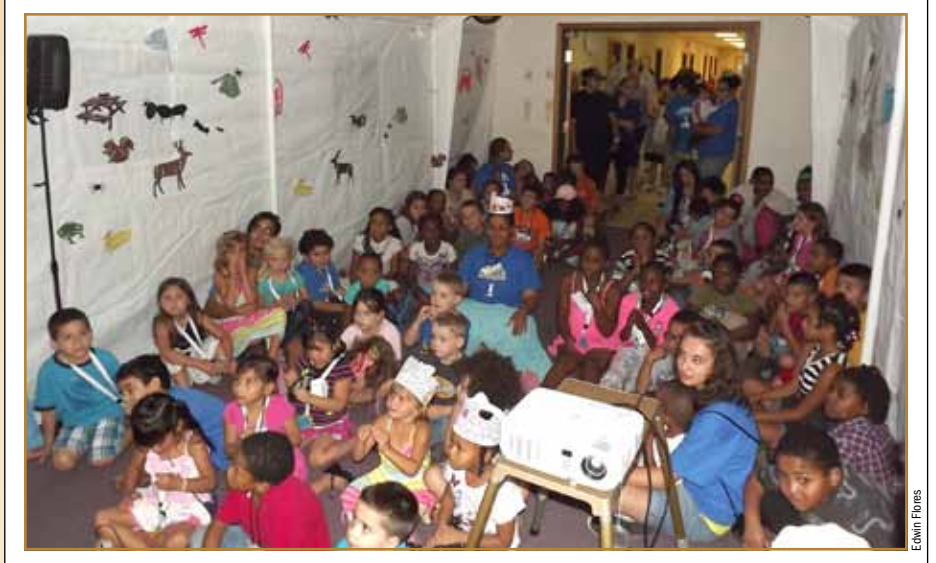
The Cherry Hill Church sanctuary was transformed to resemble a mountaintop for the church's vacation Bible school, Aug. 5-9. This year there was a 200-percent attendance increase.