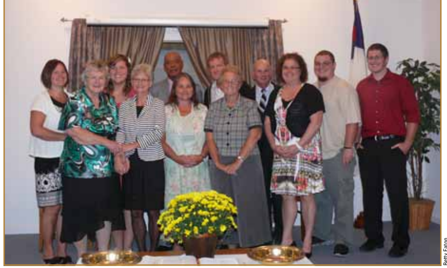
This photo includes some of those who have attended the Lewis Church for the past 20 years.