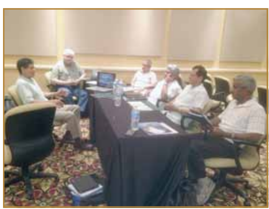
Los coordinadores hispanos de nuestra Unión comparten lo que Dios está haciendo en su territorio.

hechos Dos en especial proporcionaban mucha me satisfacción. En primer lugar sentía mucho gozo al ver a personas en diferentes lugares unirse al pueblo de Dios por medio del bautismo y luego cómo algunos de ellos trabajaban juntos para establecer nuevas iglesias. Con el tiempo llegué a comprender que el cumplimiento de la gran misión que nuestro Señor nos ha dejado se puede llevar a cabo más