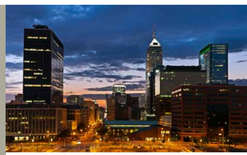
Indianapolis: Population 835 thousand with 22 churches/companies and 4,981 members

In addition, the North American Division has adopted Indianapolis as its focus for 2014. Indianapolis will also be the site of the world church's General Conference Session in 2020.