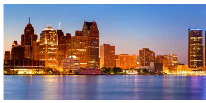
Detroit: Population 700 thousand with eight churches/companies and 4,566 members