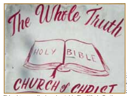
This sign was displayed outside The Whole Truth Church of Christ in Alton, III., where Catherine Casey is pastor.

As the weeks continued, the studies broadened to include all 28 fundamental Adventist Church beliefs. The flock began accepting and applying truths as they unfolded. Eventually, Casey and the church officially voted, in December