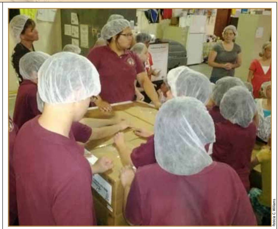
Last May, Downers Grove School students packaged meals for starving children in Nicaragua.

Very few people, if approached by a starving child, would refuse to help; but because many hungry children are far away, they are seldom thought about and, even more, rarely seen. During the Feed My Starving Children food-packing event orientation, the participants were told about two sports