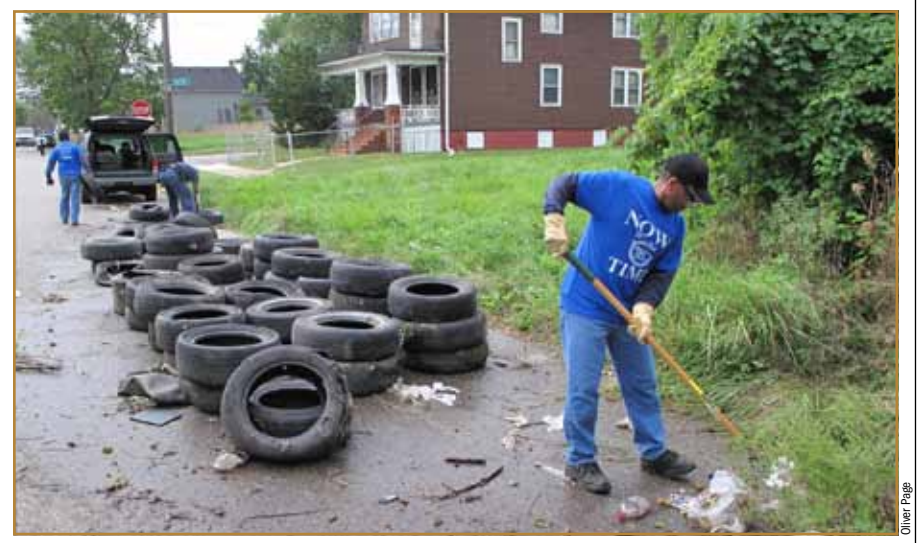
At the Community Clean-up Day, volunteers collected more than 100 discarded tires and filled two 60-foot dumpsters with 100-plus trash bags and yard debris.

"Community Clean-up Day," saw nearly 200 volunteers cut grass, trim unsightly branches, pull up weeds, collect