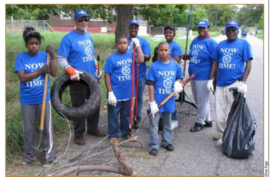
On Sunday, Sept. 2, nearly 200 volunteers showed up to beautify the neighborhood near the Burns Church, located on the corner of East Warren and Cadillac Avenues. They cleaned 24 vacant lots.