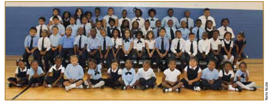
Capitol City School, in Indianapolis, experienced a 73.5 percent enrollment increase this school year.