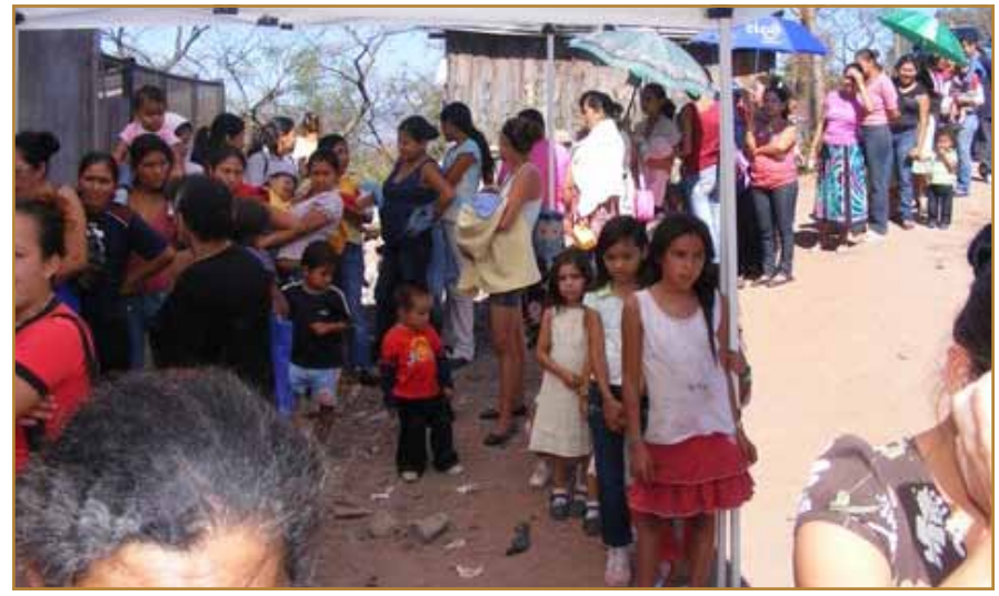
City dwellers line up before sunrise, anxiously waiting to be seen by the medical brigade. The stream of people continues throughout the day, and services continue as long as time and supplies allow.

optical and/or ministerial care. A children's ministry is also included where children can receive hair washing. lice treatments and hear the Gospel story. The site locations for medical brigades are determined through a local Honduran church, ensuring that spiritual support is still available after the brigade is completed.