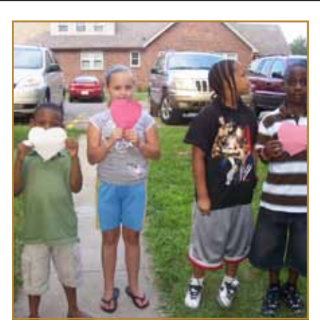
A total of 60 children attended VBS at the Emmanuel Church in Indianapolis.

For the second year, Emmanuel Church offered VBS for the adults facilitated by the church's personal