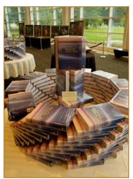
Each new Andrews University freshman was presented with an Andrews Study Bible.

Forbes.com's 2010 list of "America's Best Colleges" has ranked Andrews University as No. 446 out of 610 of "the best public and private colleges and universities—from the student's point of view." Andrews is the only Seventh-day Adventist institution to make the list. This also puts Andrews