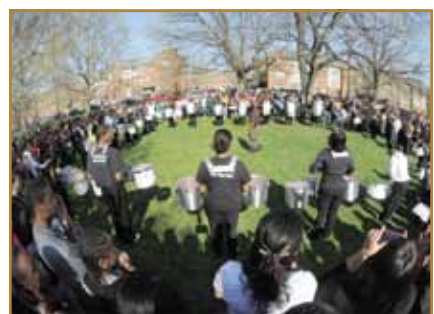
A Lake Region drum corps performs at the JCI2 closing youth rally and parade in the Goodale Park.