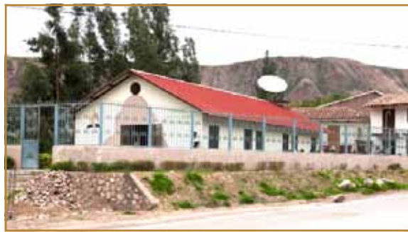
Constructed by Maranatha volunteers from the Mid-America and Lake Unions, the church in Urabamba, Peru, stands at the intersection of Highway #1 and the Inca Trail. It is Margarita's church. It is God's church.

As the face faded Margarita grabbed a colored pencil,