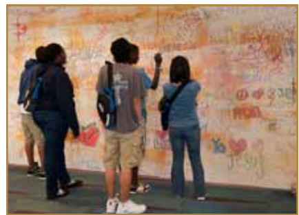
Young people read messages on a prayer wall at the JCI2 prayer conference in Columbus, Ohio.