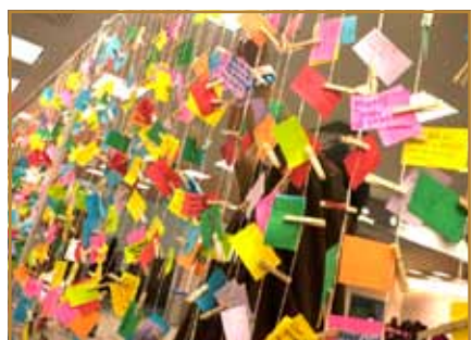
Attendees add their prayers to the ascending prayer lines at JCI2.