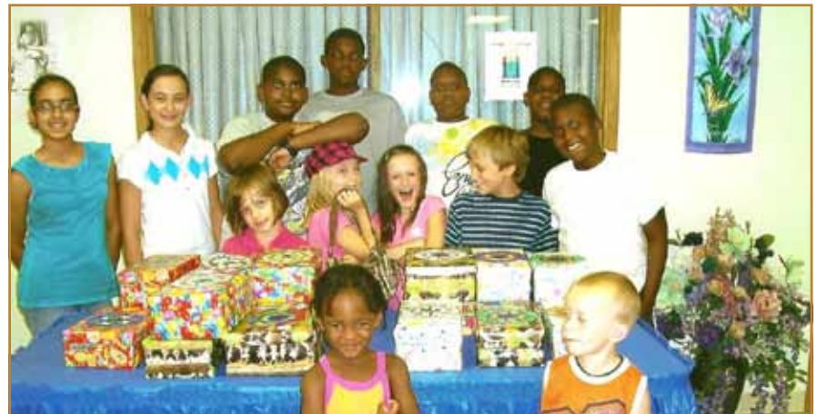
One of the most fun craft projects at the Cherry Hills VBS was creating and decorating gift boxes for young people at the Starfish Shelter in Inkster, Mich.