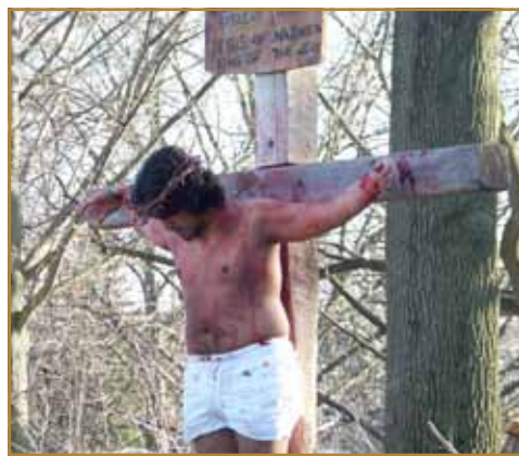
Un joven representa la escena de Cristo en la cruz.

Cuando hice los planes de asistir a este evento, lo hice pensando que necesitaba el sábado para relajarme y descansar. Pero la realidad es que todo fue diferente. Resultó ser un día de contemplación e introspección espiritual. Al contemplar esas escenas quedé profundamente conmovido. Al principio no comprendía porqué me sentía así. Pero luego me di cuenta que era porque me sentía transportado a ese tiempo cuando realmente ocurrieron esos eventos.