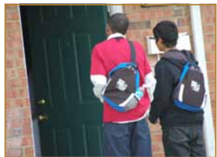
Some participants of the JCI2 prayer conference find an open door and an invitation to share Jesus.