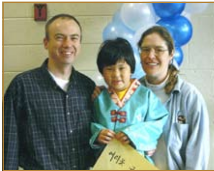
A young visitor to the Korean Cultural Festival wears a Korean costume.

Several activities included playing the Korean musical instrument, Samul nori , making food and cookies like Kimbab and Dalgona , enjoying crafts like Korean kites and Jong-ee jub-gee , playing