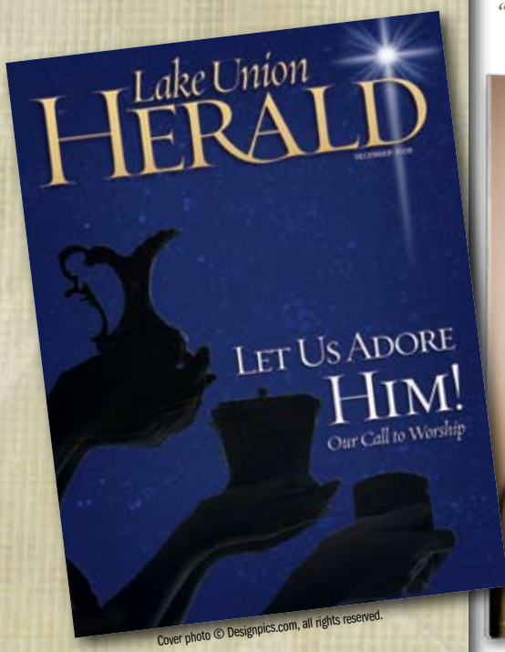
Cover photo © Designpics.com, all rights reserved.

"Telling the stories of what God is doing in the lives of His people"