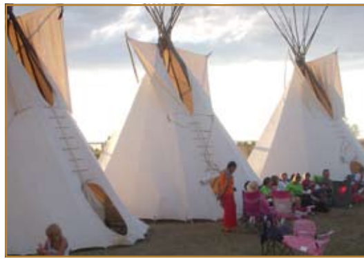
The mission team began Native American culture immersion immediately upon arrival when all participated in setting up 12 authentic tipis. They were guided by two Native Americans who demonstrated all the intricate steps.

Community service projects included painting a local church, cleaning and refurbishing outdoor recreation ar-