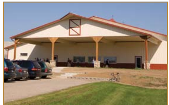
The new milking parlor was made possible by a portion of an $8.5 million gift to Andrews University in March 2007.