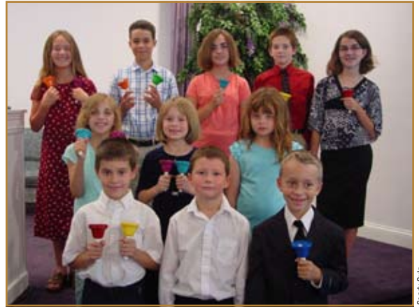
The children in the Spencer Church bell choir enjoy being a part of the worship service.

Indiana—The children's bell choir at the Spencer Church recently celebrated their sixth anniversary performing music together. The members have expressed what a wonderful blessing the bell choir has been to the church. One lady said, "They are a dedicated, sensitive group of children who really enjoy the part they play in the divine worship service. They are faithful in practice, generous with one another, and loyal to their commitment to play for the Lord."