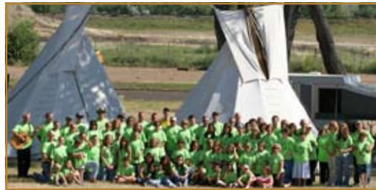
Seventy-five missionaries from Michigan traveled to the Fort Peck Indian Reservation in Poplar, Montana, where they participated in community service projects, VBS programs, health classes and other witnessing opportunities.

eas and tearing down a burned trailer. Some Native American children helped clean up their community.