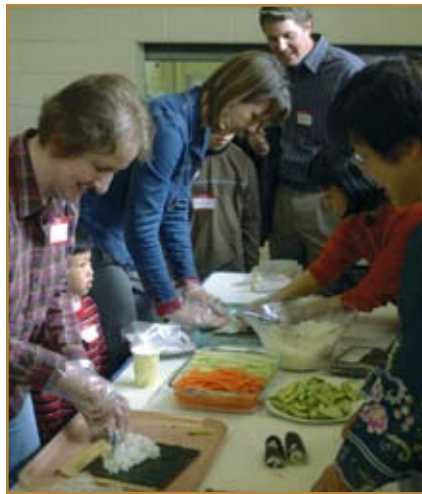
Guests enjoyed making kimbap, (Korean sushi).

The festival was planned to help form new friendships while providing an opportunity for adopted Korean children to learn about their birth country's culture. The activities, storytelling and food at the Korean Cultural Festival provided an essential experience for the children, and by becoming immersed in Korean culture, their parents learned more of their children's heritage than can be provided by books or videos. In addition, the festival provided an opportunity to express appreciation to the Korean