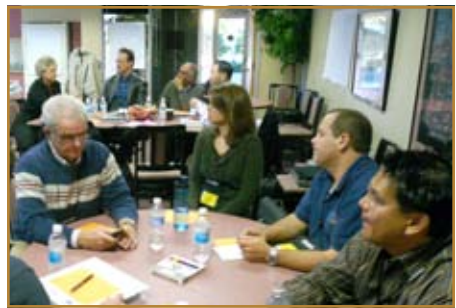
Participants in the 180° Symposium worked in groups to identify principles and recommend action plans.