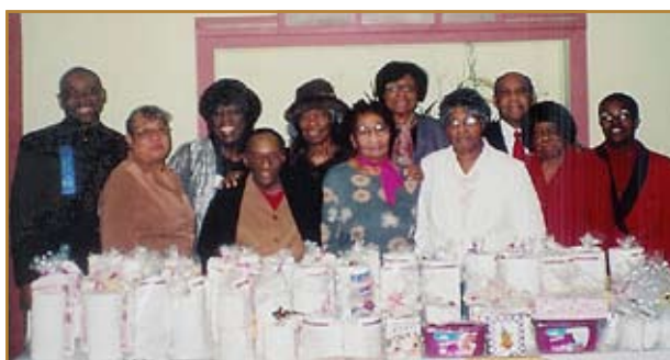
Lake Region members in Minneapolis desired to help the homeless in their community, so they collected paper products and essential toiletry items to distribute at the Project Homeless Connect event held at the downtown Minneapolis Convention Center.

Church members who helped with this project also received a blessing. One commented, “This was truly a blessing being able to help people like this. We didn’t realize that there were this many people who needed help like this.”